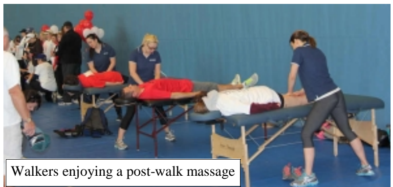
Walkers enjoying a post-walk massage